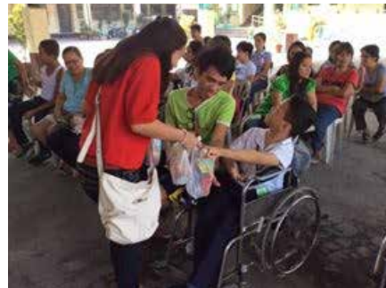
JULY: Maysan Elementary School, Valenzuela City Donation of 3in1 Printer for 70 Sped students