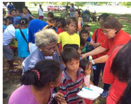
SEPTEMBER: Mabalacat Pampanga Donation of bags of groceries, slippers and pack lunch for 200 Aetas