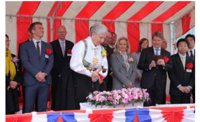
The Godmother in the process of executing her duty

And with that, my adventure was over. An incredible, fantastic day packed with new experiences and impressions was now history. A day I will never forget. It is hard to