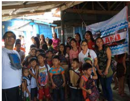
JUNE: Brgy. Pasong Langka, Silang Cavite Donation of School Supplies for 115 students