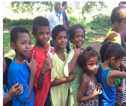
NOVEMBER: Mabalacat Pampanga Donation of bags of groceries with rice for 200 Aetas