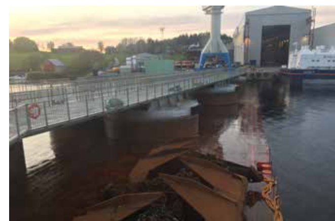
Over/ above: Lasting av flytende gangvei / Loading a floating gangway