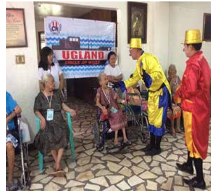
DECEMBER: St. Joseph Foundation Gift Giving for 7 elders