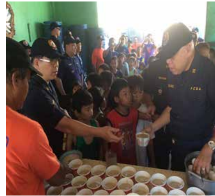
MARCH: Alabang Muntinlupa City Feeding Program for 150 children