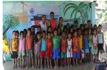
APRIL: Brgy. Malapad Elementary School, Real Quezon Donation of Raincoats, rain boots and multi-vitamins to 60 students