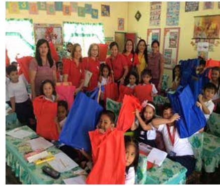
FEBRUARY: Brgy. Sta. Cruz Elementary School, Sta. Maria Bulacan Donation of School Supplies to 145 grade 1 students