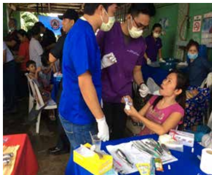
AUGUST: Alabang, Muntinlupa City Dental Mission for 130 residents