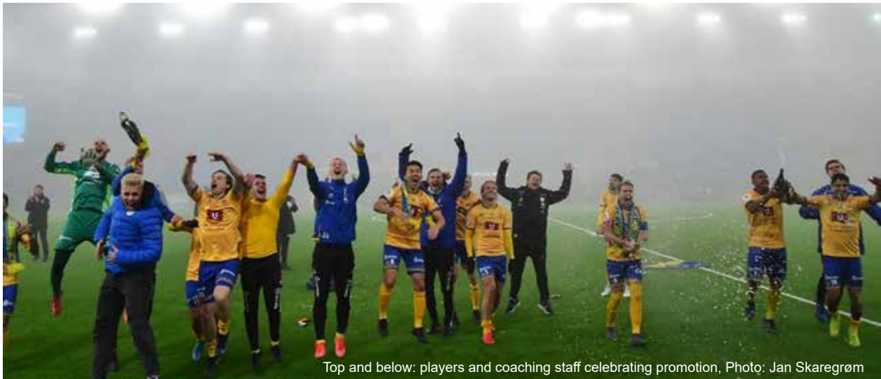
Top and below: players and coaching staff celebrating promotion

Entering into the Norwegian Premier League is a huge step up for a club like Jerv. Preparations have been ongoing since the promotion in December to meet strict requirements related to stadium facilities and capacity and the team preparing for the first tough season at the highest level in Norway. Jerv is a club based on volunteers to a large extent and has by far the smallest administration in the league. The team is expected to have a tough season by all experts, however as Jerv has