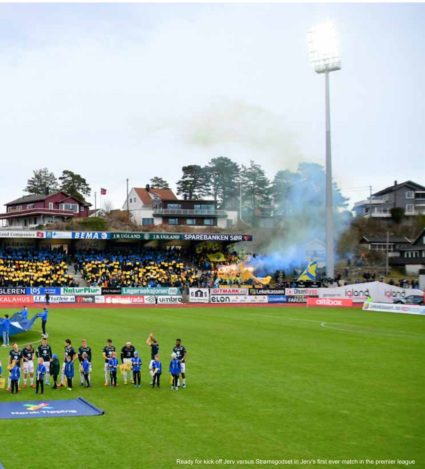
Ready for kick off Jerv versus Strømsgodset in Jerv's first ever match in the premier league

FK Jerv finished the season in third place which meant the third chance to make it to the NPL through play-offs. After beating KFUM on the home ground in J.J. Ugland Stadium Levermyr on penalties, the team prepared to meet SK Brann, Bergen in a single play-off final in Oslo on December 15th 2021. SK Brann was big favourites before the game and during parts of the match they showed their