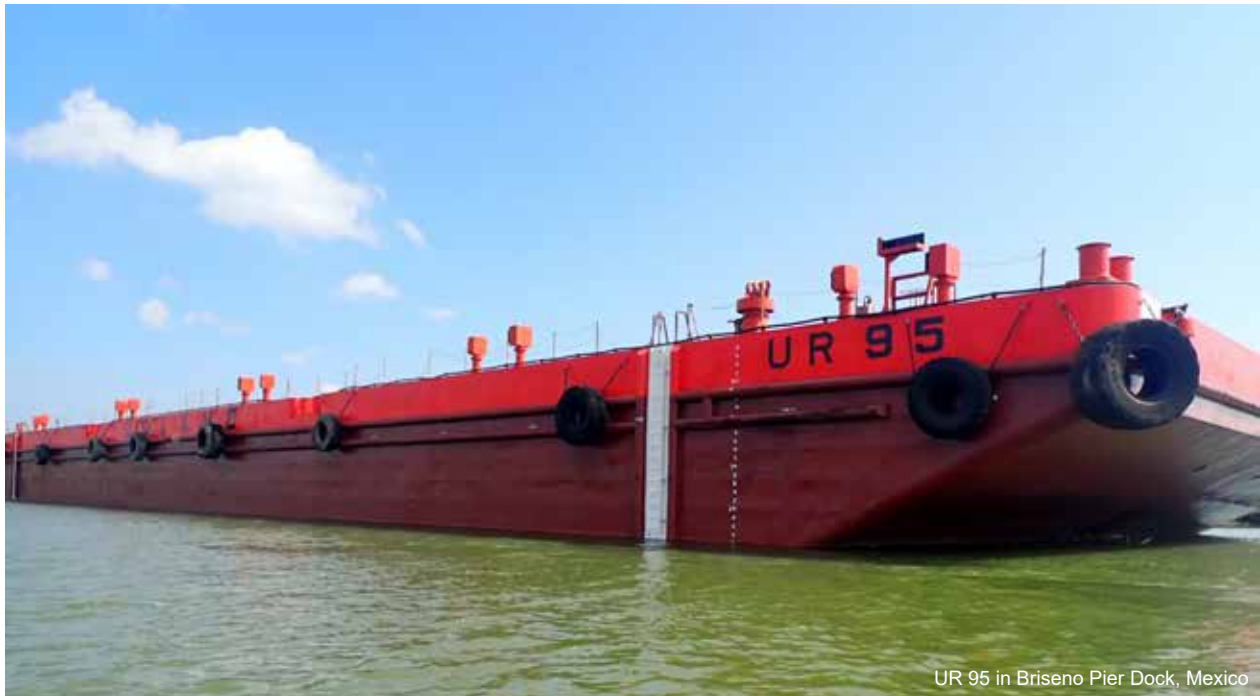
UR 95 in Briseno Pier Dock, Mexico

tion, Compliance. The first two must be carried out by October 2022 and the third by the end of 2023. CII will run from 2023 to 2030. The new requirements do not currently apply to PSV vessels.