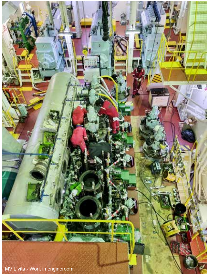
MV Livita - Work in engine room

The Covid-19 pandemic has led to major challenges with crew changes on our vessels. As a result of restrictions in most countries that has affected crew changes, many of our crew members have been onboard beyond their contracts. With great flexibility from all parties, we have nevertheless made it through 2021 with no major problems. Since October 2020, we have participated in an arrangement with a quarantine hotel in Manila. This is to prevent embarking crew members from bringing infection onboard. Our ex-