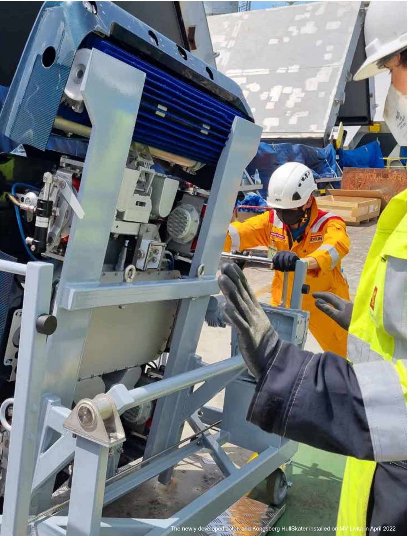
The newly developed Jotun and Kongsberg HullSkater installed on MV Livita in April 2022