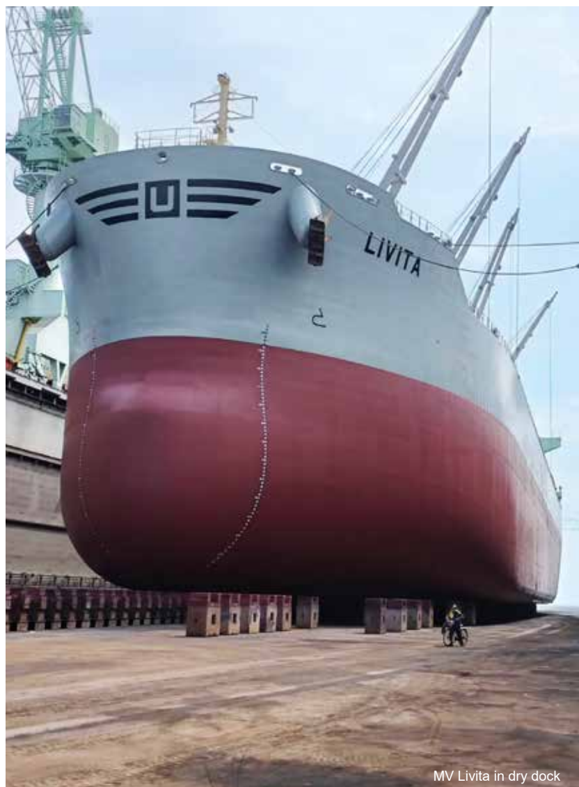
MV Livita in dry dock

Ugland Marine Services AS, Canship Ugland Ltd. and the vessels are certified according to IMO's "International Ship Management Code" (ISM). The vessels are also certified in compliance with "The International Ship and Port Security Code" (ISPS). Both companies are also certified to ISO 9001:2015 Quality Management, ISO 14001:2015 Environmental Management and ISO 45001:2018 Occupational Health and Safety Management System.